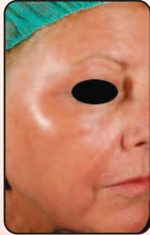
One month after Lux2940 Tx

"The Lux2940 is a very useful and innovative device that will bring the treatment of photodamage to a new level."