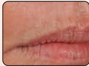
Lip one month after Lux2940 Tx

“If patients want a single treatment procedure and can handle a few days of downtime, they can choose the Lux2940 procedure.”