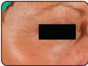
Eye before Tx